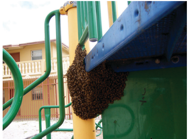
Figure 1. A swarm of bees has clustered on playground equipment.

Good colony management includes swarm prevention. Proactive beekeeping practices to alter colonies in response to potential swarming behavior must be undertaken regularly during the swarm season. Good management maintains strong colonies and allows for greater honey production and the potential to split and increase the total number of the beekeeper's colonies, all of which makes beekeeping much more profitable for hive owners.