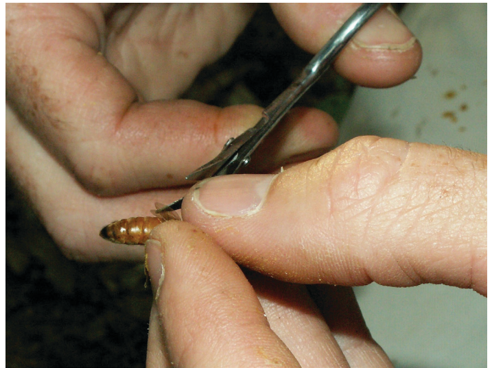
Figure 9. Take a small pair of scissors and cut off ½ of the forewing (the large, front wing) on one side of the queen's body. Credits: Amanda Ellis

Removing queen cells from colonies before they swarm, a technique called “cutting queen cells,” is useful as a swarm behavior repressor. Cutting queen cells involves inspecting colonies weekly immediately before and during swarm season in an effort to remove queen cups and queen cells from the colony. This is a time-consuming endeavor and most practiced by hobbyist and sideline beekeepers. This technique works best when the hive is inspected every seven to nine days. When done, every frame in the colony containing brood should be removed from its respective super and the bees shaken from the frame (over the hive body) with 1–3 quick shaking motions. It is important to shake as many bees from the frame as possible because bees can easily hide swarm cells on a frame. If one queen cell is missed and allowed to be capped, the hive will be prompted to swarm. It only takes about seven to ten days for new capped queen cells to develop, so it is important to repeat this process weekly.