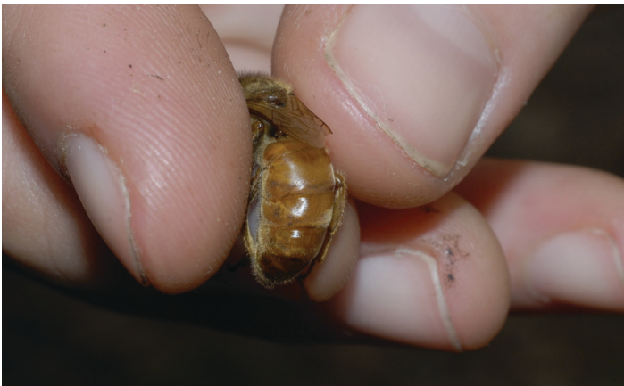
Figure 7. A healthy queen with her wings clipped to prevent her from leaving the colony with the swarm.

small pair of scissors and cut off ½ of the forewing (the large, front wing) on one side of the queen's body (Figures 8 and 9). A clipped queen will try to leave the colony with a swarm, but she will not be able to fly away with it, and the swarm will return to the nest. Frustrated swarms (those that cannot “coerce” their queen to swarm because she is clipped) often kill their queen in an attempt to rear one that can fly. So, clipping a queen's wing is more of a safety net than a method of reducing the swarming tendency. This technique is most effective in controlling swarms when other swarm control methods are practiced at the same time. Worth noting is that a clipped queen sometimes will be unable to reenter the colony after a failed swarm attempt. In this instance, she will climb up a nearby bush or under the colony where the swarming bees will cluster around her. These swarms are easy to capture and can then be housed in a new hive. One should not try to reintroduce the swarm back into the parent colony. Once a colony tries to swarm, it will continue to do so.