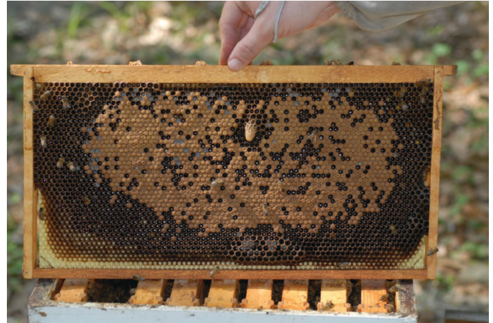
Figure 5. A queen cell within the brood pattern or on the outer edge of the brood pattern is normally, though not always, a sign of queen supersedure.

a day old) worker larva, the resulting queen likely will be inferior. Because of this, workers typically make supersedure cells at the perimeter of the brood pattern, because this is where the youngest worker larvae typically reside (Figure 5). As with everything in nature, there are always exceptions and you may find supersedure cells along the edge of the frame (or normal queen cells within the brood pattern).