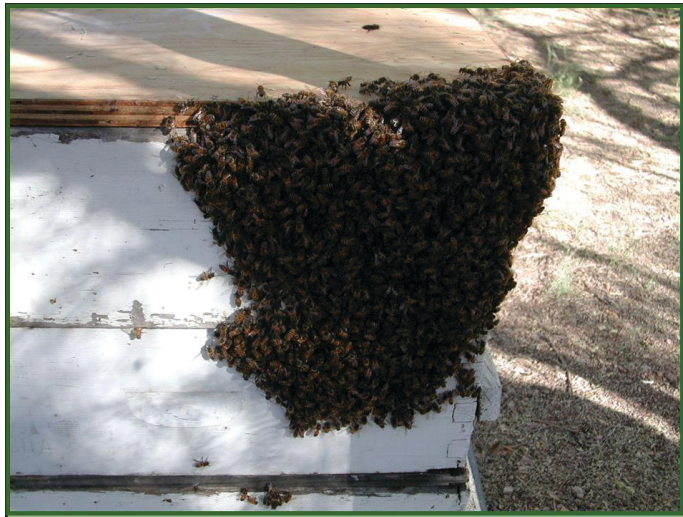
Figure 6. Usurpation of a European honey bee colony by an African honey bee swarm.

smaller. Africanized swarms are docile like European swarms, with the defensive characteristics manifesting only after a colony establishes a nest, builds comb, and the population begins to grow. However, it is possible for an Africanized swarm to take over a European honey bee colony (called usurpation), replacing its queen with the Africanized queen (Figure 6). The Florida Department of Agriculture and Consumer Services recommends that beekeepers requeen managed honey bee colonies that are headed by suspicious queens with European honey bee queens purchased from reputable sources. For more information on Africanized bees, see: http://edis.ifas.ufl.edu/in790 .