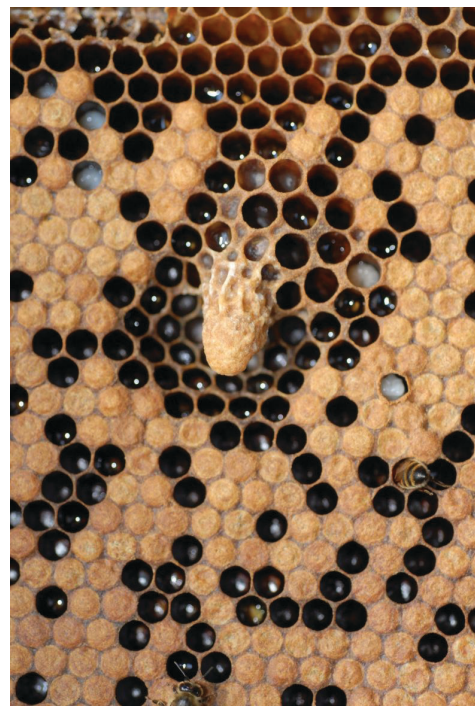
Figure 3. A capped queen cell.

During the swarm, about 50–70% of the worker bees rush out of the hive (though this percentage varies), herding the old queen out as they go. The old queen takes flight, lands on a nearby structure (tree branch, fence post, etc.), and the worker bees circling around her land on her, forming a cluster typically ranging in size from a softball to