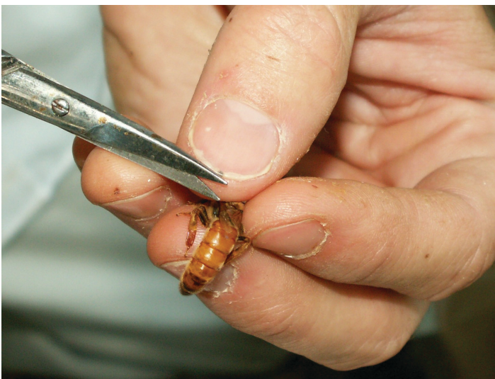
Figure 8. The proper position in which to hold a queen to facilitate wing clipping.