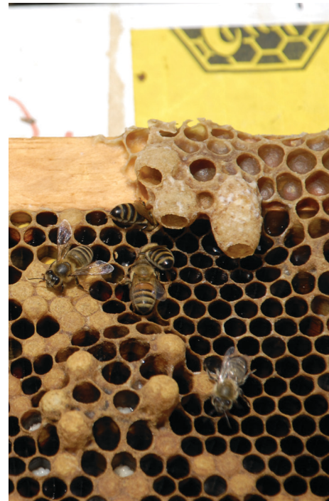
Figure 2. This photo shows two queen cups (no developing larvae present) left-of-center and a growing queen cell (containing a developing larvae) right-of-center.

The colony undergoes a number of changes in preparation for swarming. The queen loses a great deal of body weight (worker bees lower the amount of food they provide to the queen—i.e., they put her on a diet), which will aid in her ability to fly to a new hive site. Furthermore, the queen's egg-laying output decreases significantly. Worker bees in the colony begin to crowd the nest, gorging themselves on honey. Other normal activity, such as foraging, will cease temporarily. An audible pitch begins to develop among the workers and a hive about to swarm is significantly louder than one that is not about to swarm.